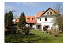
A Storybook House in Prague Is for Sale New York Times