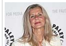
This Is What The Cast Of 'WKRP In Cincinnati' Looks Like... Answers.com