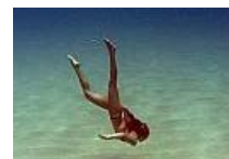
21 Women So Beautiful They Put Nature To Shame Wandering Pioneer