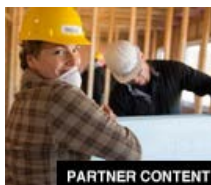
Corporate giving more 'nice to do'