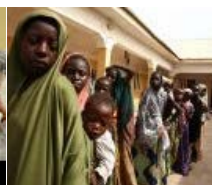
'Alarming spike' in wo...