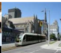
Hamilton to get a new L...