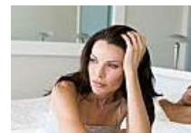
Never Trust Your Boyfriend If He Does These 10 Things Klickworthy